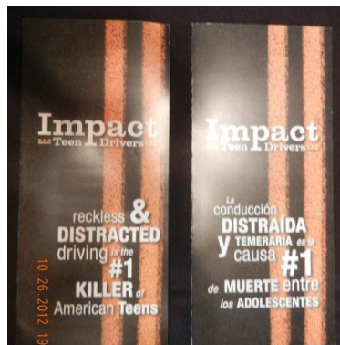
Brochures: English or Spanish